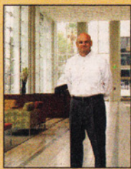
FORMER Marine oversees Ratkovich building. 11